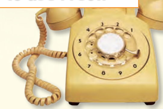
Freon is becoming as rare as a rotary phone!

If you want to cut both high energy costs and Freon out of your life, please talk to us about your options in new systems. All the a/c systems we install today use an economical and environmentally friendly refrigerant—instead of wildly expensive Freon. You may also qualify for a tax credit when you upgrade your system. (See related article below.)